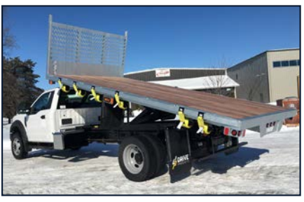
GALVANIZED STEEL WITH WOOD FLOOR

The ideal team member for anyone in the lumber or home building industry, Voth's dumping flat deck is available in steel, aluminum, or galvanized steel with apitong wood floor. Make lumber deliveries a breeze with the optional rear roller.