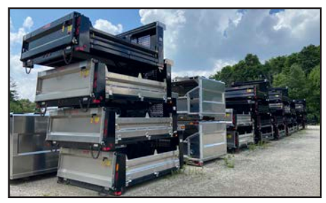
Voth Truck Bodies in Courtland, ON